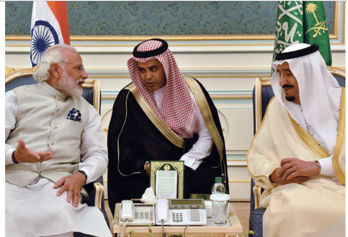
Left: PM Modi interacts with the employees at the All Women TCS IT Centre in Riyadh; Above: Prime Minister Narendra Modi with King Salman bin Abdulaziz Al Saud of Saudi Arabia at the Royal Court, Riyadh

which are looking at the India opportunity anew, a new synergy which has also been reflected in the visits by PM Modi to the UAE in August last year, and the return visit by Crown Prince Sheikh Mohammed bin Zayed Al Nahyan to India (Feb 10-12, 2016). In a special gesture, PM Modi received him at the airport, signifying India's intent to scale up the India-UAE relationship. The big takeaway from the Crown Prince's visit was an upgradation of economic partnership and the unveiling of a concrete plan to rope in the UAE as a preferred partner in India's growth story. PM Modi invited UAE companies to participate in projects creating mega industrial manufacturing corridors, including the Delhi-Mumbai Industrial Corridor, and