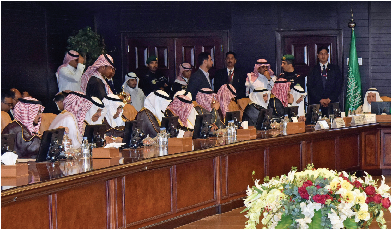
PM Modi in a meeting with Saudi business leaders in Riyadh

The pact to curb terror will reinforce recent trends of cooperation that has generated much goodwill in India. Besides anti-terror cooperation, India and the Gulf’s most