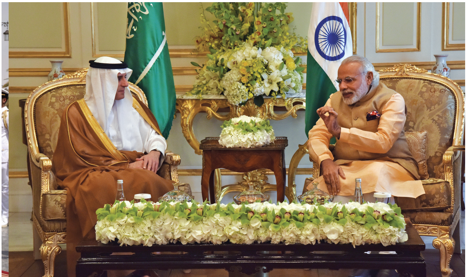
Facing page: Indian Prime Minister being received at the Royal Court in Riyadh, Saudi Arabia; Below: PM Modi meeting the Saudi Minister of Foreign Affairs, Mr Adel Al Jubeir, in Riyadh

PM Modi's visit to Saudi Arabia was first trip by an Indian PM to the world's largest producer of oil